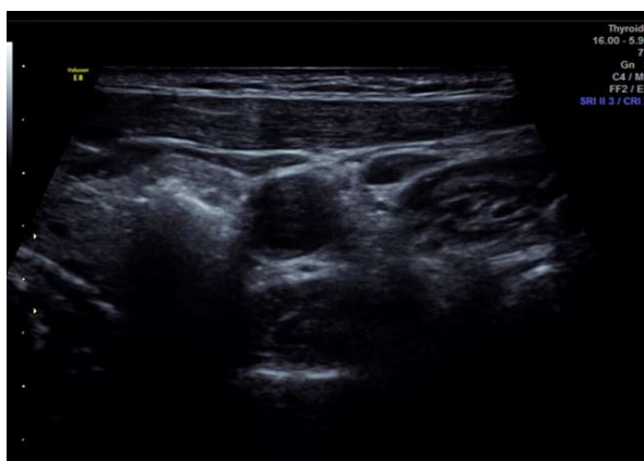
Figure 1 Ultrasound image of microwave ablation of thyroid tumors.